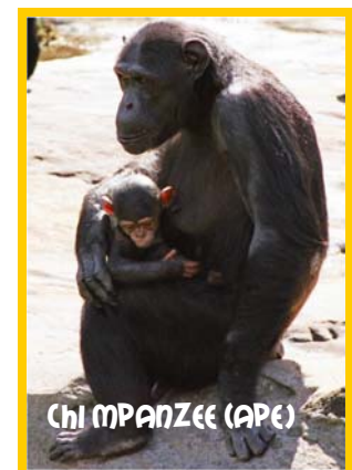
CHI MPANZEE (APE)

PLEASE: The sign for "please" is made by placing your flat right hand over the center of your chest. Move your hand in a clockwise motion a few times. (From the observer's point of view, use a circular motion towards your left, down, right, and back up.)